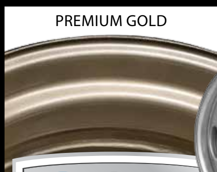
DEEP DISH FACING FRONT FACING