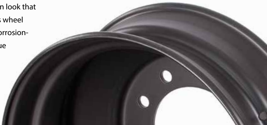
STANDARD SATIN BLACK

The Gloss Series features a high-gloss finish.